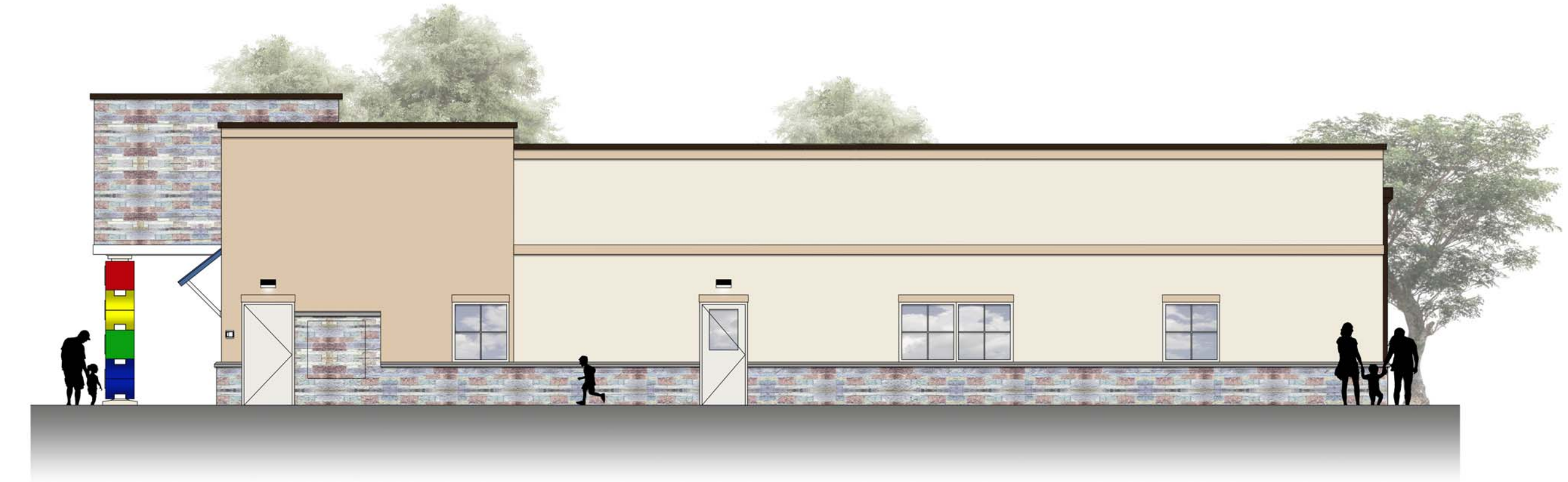
EAST ELEVATION SCALE 1/8 = 1'-0"