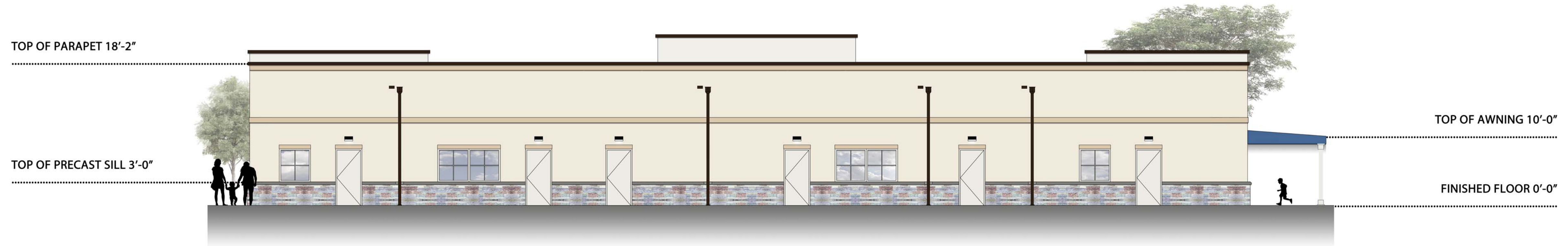
SOUTH ELEVATION SCALE 1/8 = 1'-0"