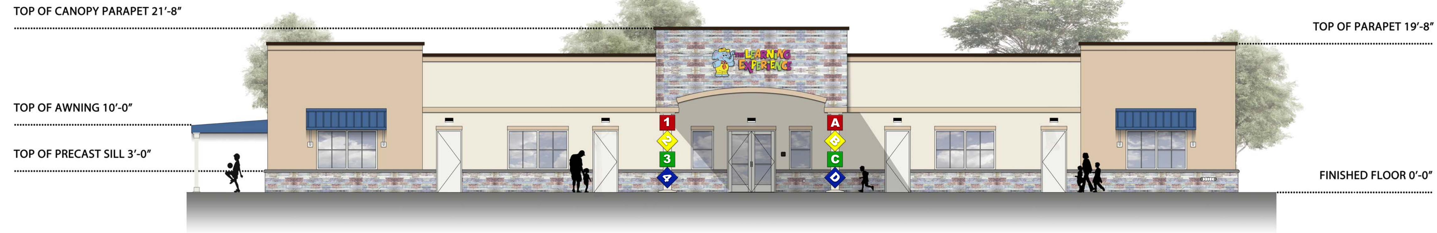
NORTH ELEVATION SCALE 1/8 = 1'-0"