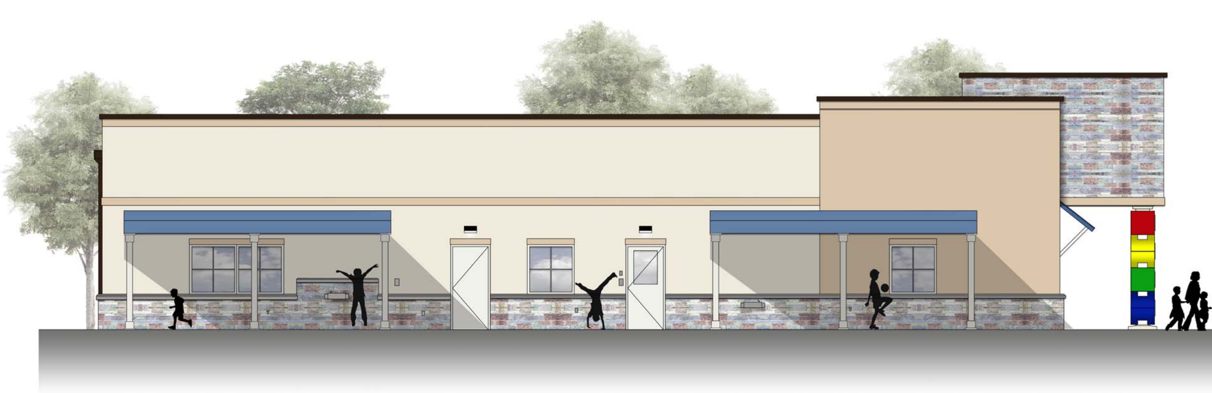
WEST ELEVATION SCALE 1/8 = 1'-0"