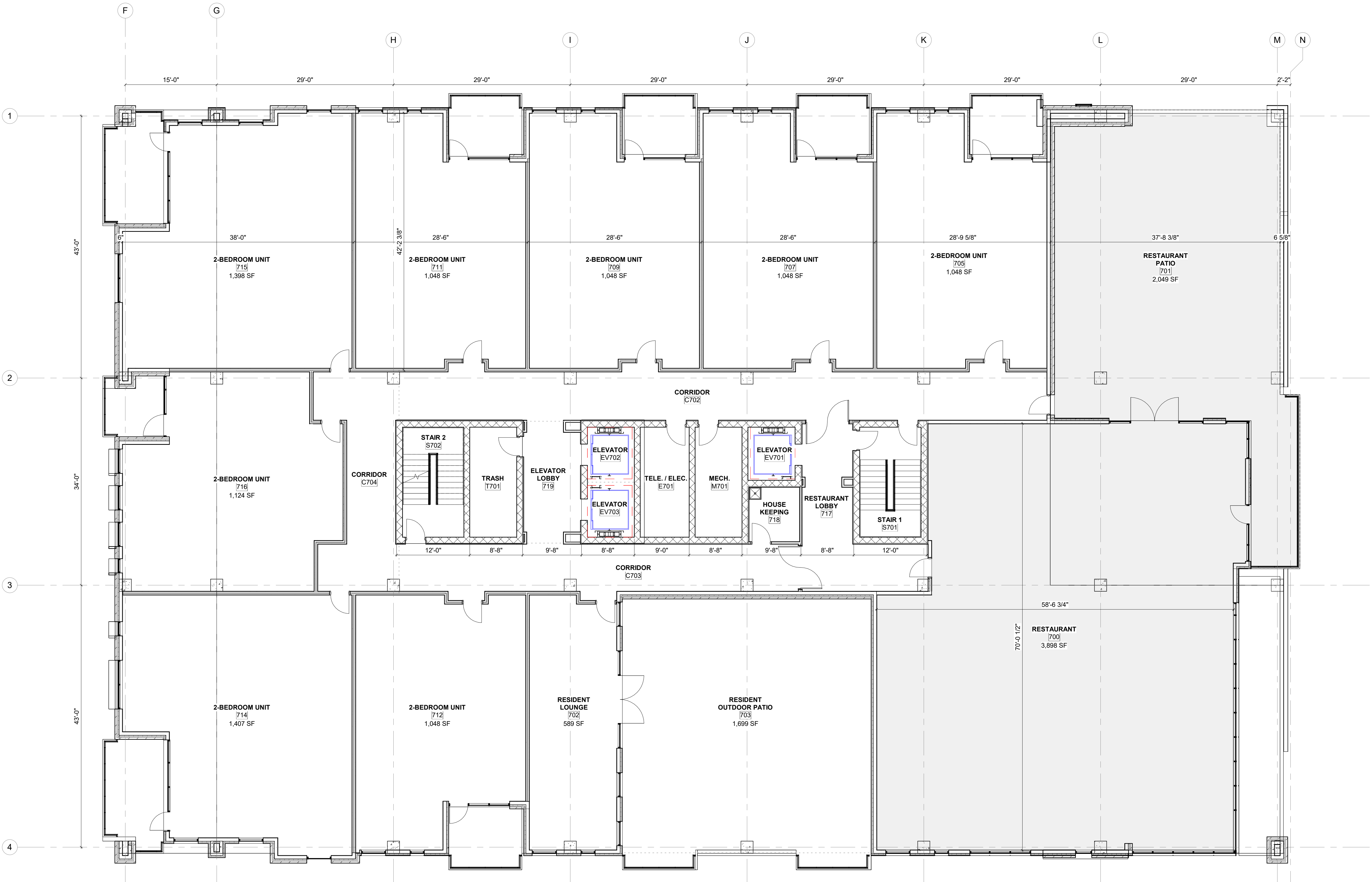
1 PLAN OVERALL - LEVEL SEVEN 1/8" = 1'-0"