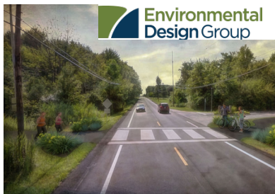
Copley Township Park Entrance After