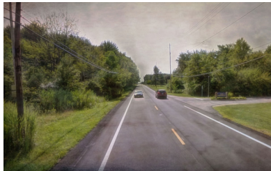
Copley Township Park Entrance Before