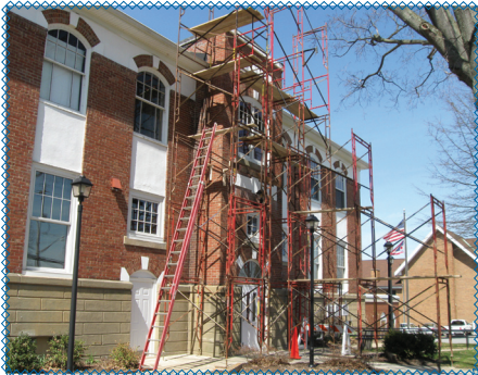
Construction Project as of April 1, 2009

Hemminger Construction is in the process of finishing the elevator shaft and roof repairs. Once the shaft is completed, Otis Elevator will begin installing the elevator. Once the elevator is installed, work on the Bell Tower will begin. The original bell is on the sign in front of the Town Hall. It will be removed from the sign and re-installed in the tower to once again take its place where it was set over 100 years ago.