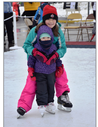
Iceless skating rink sponsored by MultiBase

Thanks to the generous donations from local Copley businesses, all events were free, including food and refreshments. A VERY BIG Thank You to all the businesses below for making Winterfest possible in 2018.