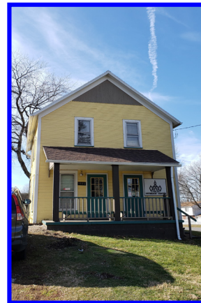
Copley Outreach Center