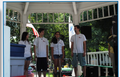
National Anthem sung by St. Luke's Ministries Youth Group