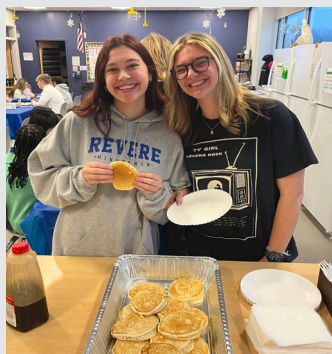
Revere High School Students enjoying a pancake breakfast as part of their Momentum Meal.

Copley-Fairlawn City Schools and Revere Local Schools continue to support students through the Positive Behavior Interventions and Supports (PBIS) framework. PBIS is a school wide approach that focuses on promoting positive behavior, helping students succeed both academically and socially. Both school districts implement PBIS in age-appropriate ways, using incentives, recognition programs, and consistent expectations to reinforce positive choices. By focusing on prevention and early support, PBIS helps students build essential life skills that contribute to a safe, welcoming school environment. While both districts are pioneering this proactive system for education, their methods differ slightly.